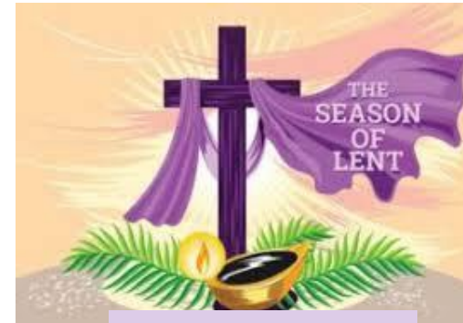
Stations of the Cross every Friday during Lent at 7:00 p.m.