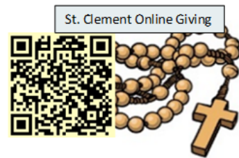
St. Clement Online Giving