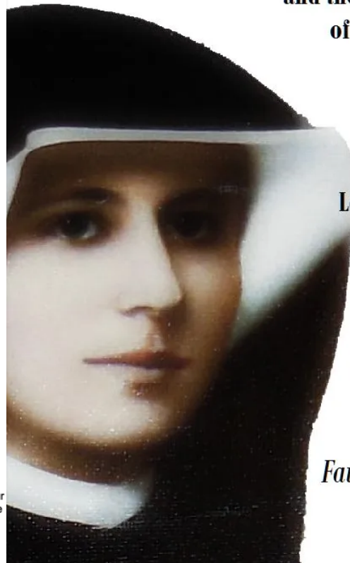
St Mary Faustina Kowalska (1905-1938)

Let our judgement of souls cease, for God's mercy upon them, is extraordinary.